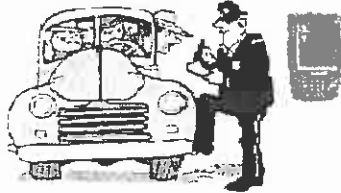
Officer with Symbol 8846 Wireless Unit

Officers can collect data by swiping Drivers License through Mag Stripe Reader, Gain Vehicle Make, Model, and Year through a scan of the VIN Tag, and easily choose offenses from drop down menus on the mobile device. Options are also available to gain key information (such as name) from credit cards, local student ID cards, etc. should an offender be without a license at time of traffic stop.