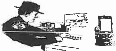
Municipal Court and Police Department

Captured Citations are uploaded into the appropriate PD and Municipal Court Databases (without the need for an intermediary server). Officers simply place the handheld devices in their cradles at the end of the shift, and all citations are downloaded automatically, while software upgrades and changes download to the devices automatically as well.