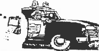
Vehicle with Wireless Zebra Printer

Handheld unit can speak directly to the printer via an 802.11b connection, so that the officer can collect ticket (printed while officer is walking from offender's car) at the officer's vehicle. Citation printout can include all required instructions for the offender, offender's signature, and can be designed to match the specific requirements of each PD